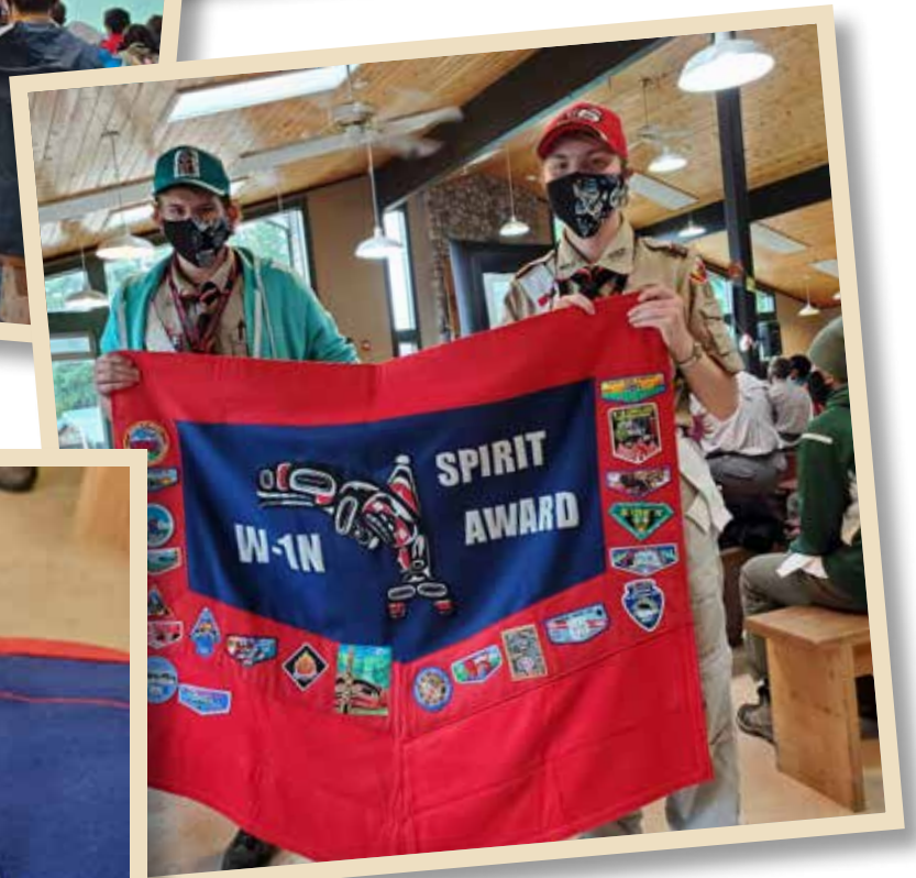
Lodge wins Best Lodge Spirit Award.